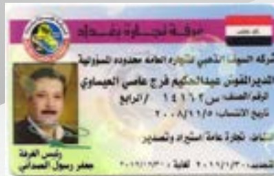
Baghdad Chamber of Commerce