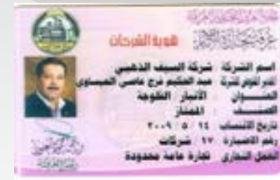
Federation of Iraqi Chambers of Commerce